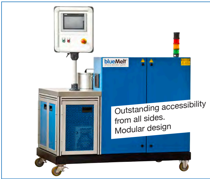
Outstanding accessibility from all sides. Modular design