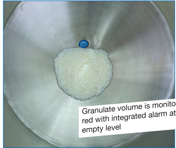
Granulate volume is monitored with integrated alarm at empty level