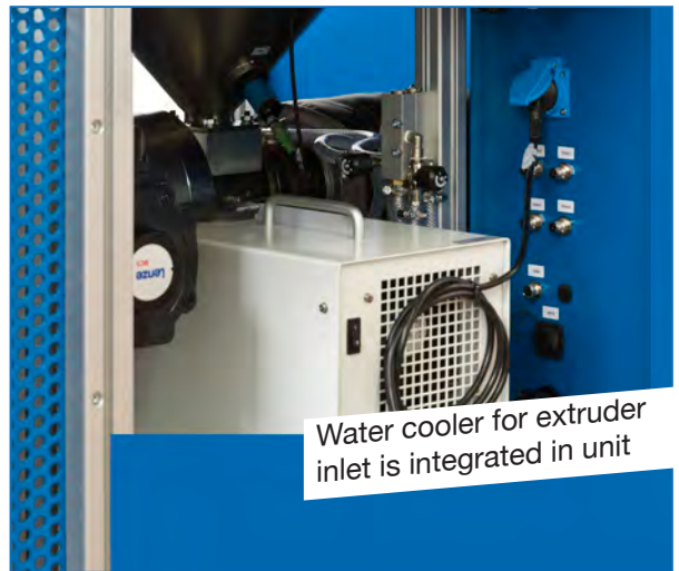
Water cooler for extruder inlet is integrated in unit