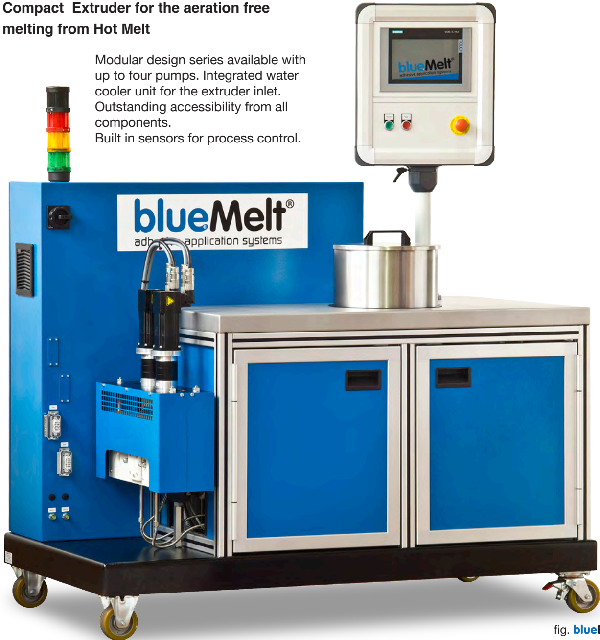
fig. blueEX 12-2P

Modular design series available with up to four pumps. Integrated water cooler unit for the extruder inlet. Outstanding accessibility from all components. Built in sensors for process control.