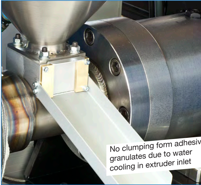
No clumping form adhesive granulates due to water cooling in extruder inlet