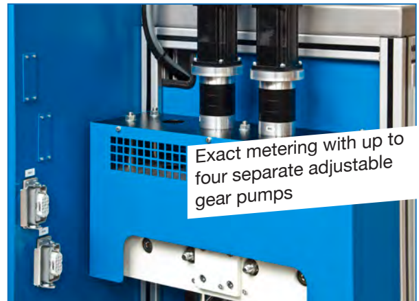
Exact metering with up to four separate adjustable gear pumps